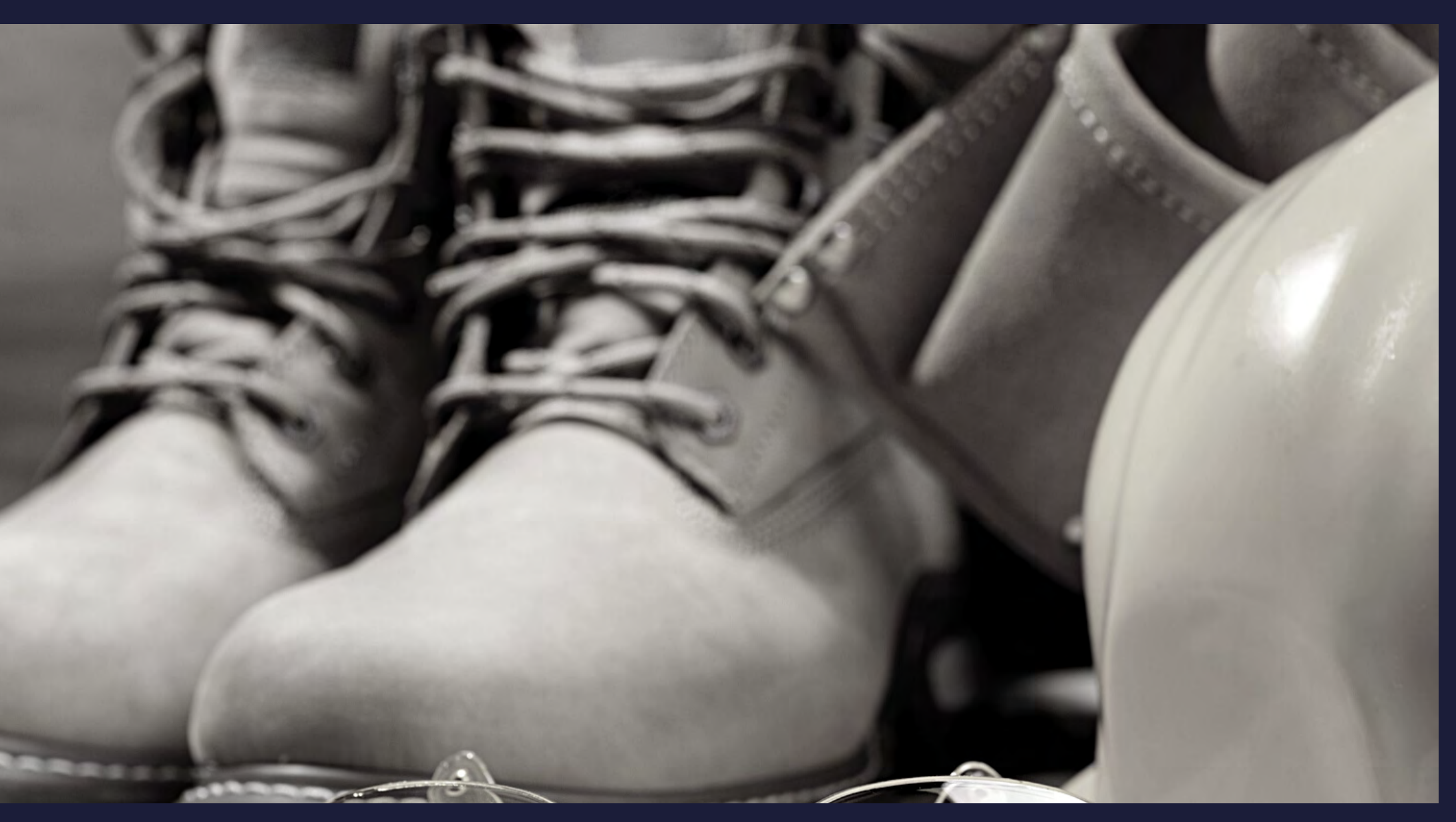
Students must provide their own safety footwear

Books $250.00 Incidental Fees $455.00 Regular Tuition $16,500.00 Total $17,205.00*